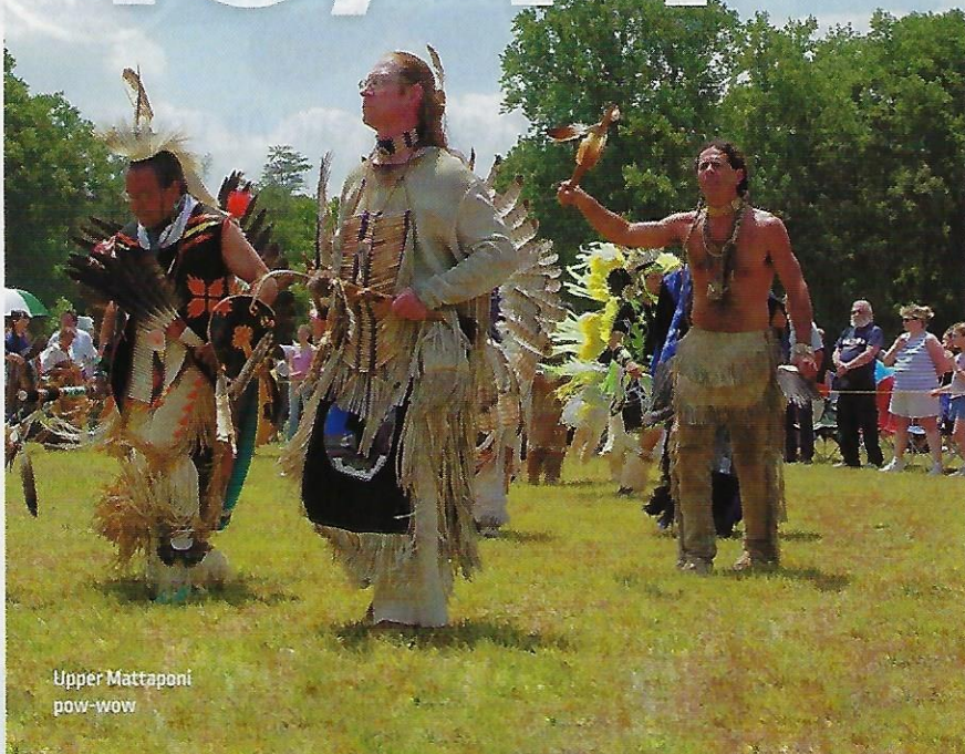
Upper Mattaponi pow-wow

West Point is the home of many local festivals, including the West Point Crab Carnival and Christmas on the Town. The Crab Carnival, held each October, features a fun run/walk, a parade, and lots of seafood and vendors. Several times a year, the Pamunkey Indian Reservation and Mattaponi Reservation have events that draw visitors, and their museums are open to the public. The Pamunkey Indian Museum and Cultural Center, which resembles ancient Pamunkey homes, tells the story of the people from the Ice Age through today. The Mattaponi Indian Museum has a necklace in its collection that once belonged to Pocahontas. The Hanover Tomato Festival takes place in Pole Green Park in July, luring thousands of people who can't get enough tomatoes no